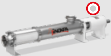
Progressive cavity pump: Kiber