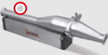
Product recovery system: PIG