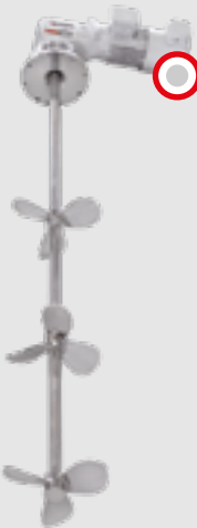
Agitator with mechanical seal: CXC