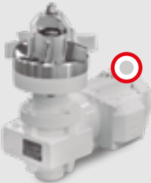
Magnetic agitator: BMA