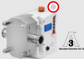
Rotary lobe pump: SLR