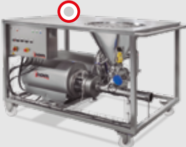
Table blender: MM