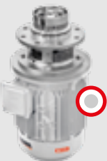
Tank bottom mixer: ME 6100