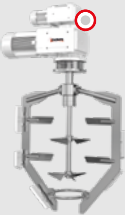
Counter-rotating agitator: MCR